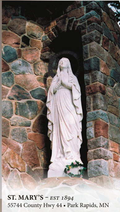
ST. MARY'S - EST 1894 55744 County Hwy 44 • Park Rapids, MN